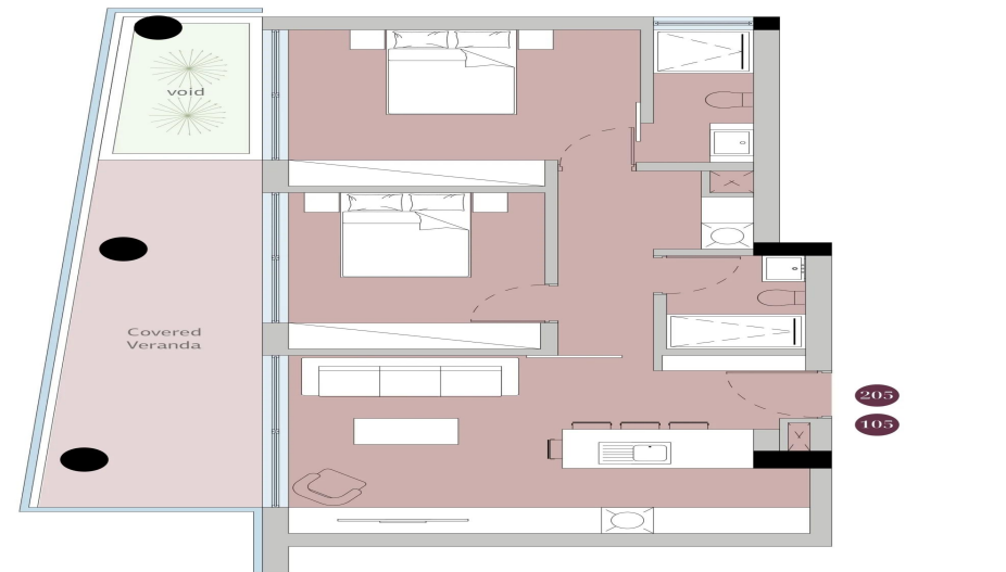
ROOM VIEWS RESIDENT