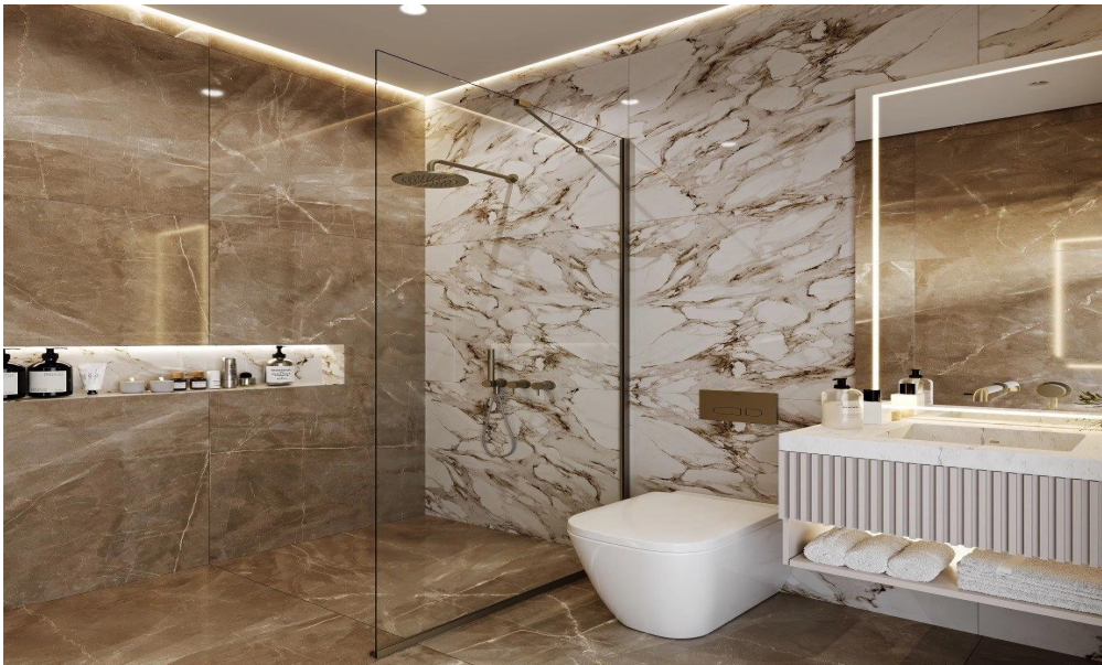
ROOM VIEWS RESIDENT