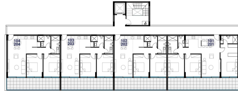
BLOCK A1 . A2 . A3 1ST & 2ND UPPER FLOORS