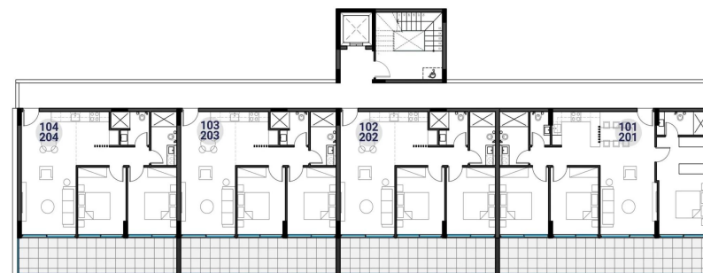
BLOCK A1 . A2 . A3 1ST & 2ND UPPER FLOORS