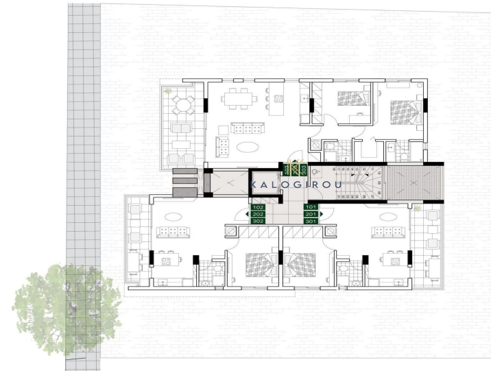
1 st 2 nd 3 rd Floor