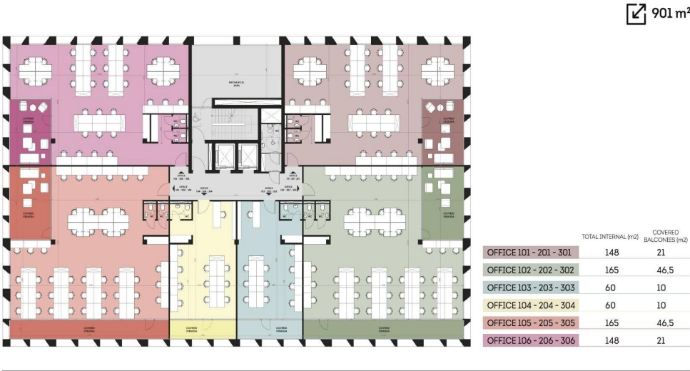
1ST - 2ND & 3RD OFFICE FLOOR