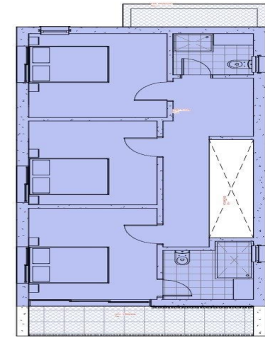
FIRST FLOOR AREAS 1:100