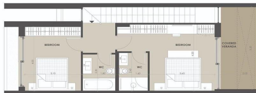
■ 1ST FLOOR