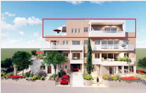
PENTHOUSE 301 BLOCK 7