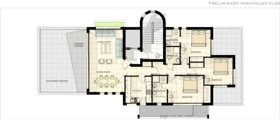
PENTHOUSE 301 BLOCK 7