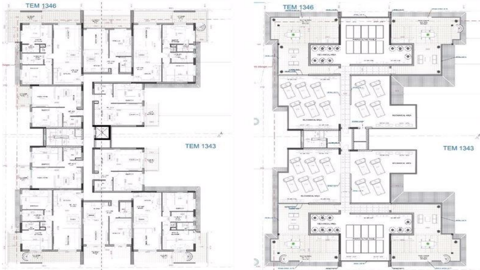
BLOCK A (SECOND FLOOR)