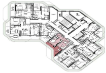
4th floor plan