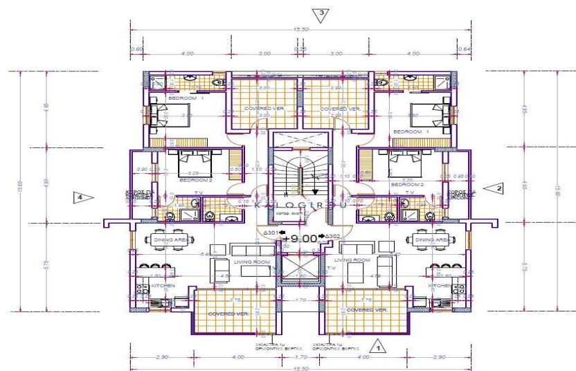
ΚΑΤΩΦΗ 3ου ΟΡΟΦΟΥ