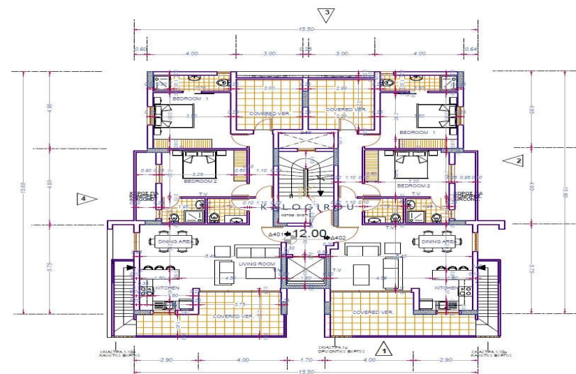
ΚΑΤΩΦΗ 4ου ΟΡΟΦΟΥ