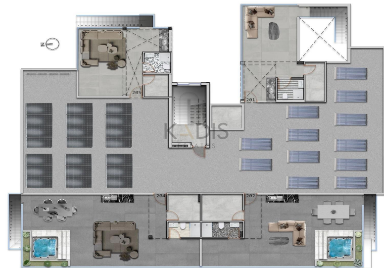
THIRD FLOOR PLAN (ROOF GARDENS)