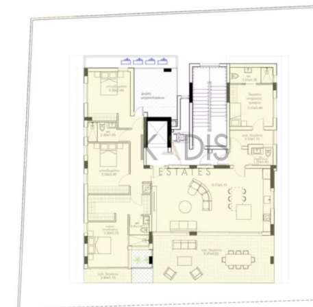
ΚΑΤΩΗ 1ου ΟΡΟΦΟΥ