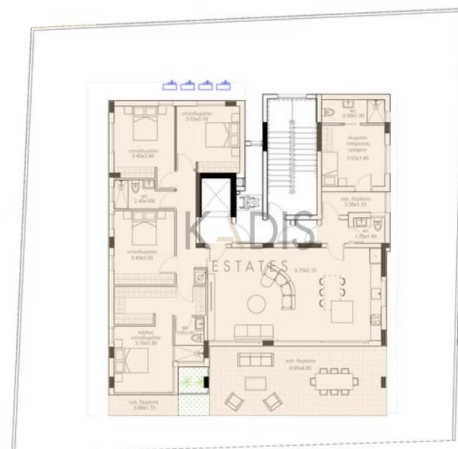
KATOVI 5ou OPOFOY