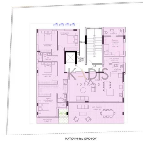
KATOVI 4ou OPOFOY