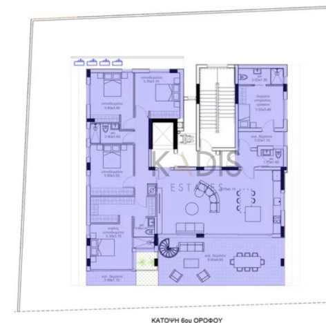
KATOVI 6ou OPOFOY