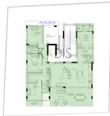
KATOVI 3ou OPOFOY