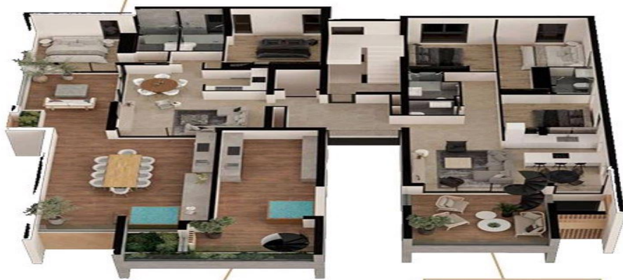
Roof Garden 202