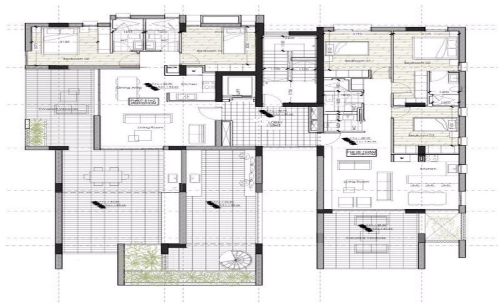
Apartment 302 102m 2 covered living area 22m 2 veranda area 40m 2 roof garden 3 bedrooms 2 bathrooms (1 en-suite) 1 parking