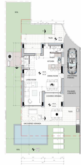
KATONH ISOΓEIOY_KATOIKIA 13 KΛIΜAKA 1:100