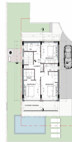
KATONH 1ΟΥ ΟΡΟΦΟΥ_KATOIKIA 13 KΛIΜAKA 1:100