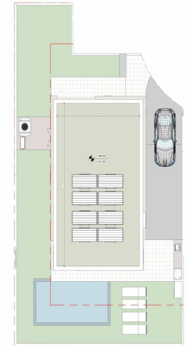
KATONH ΟΡΟΦΗΣ_KATOIKIA 13 KΛIΜAKA 1:100