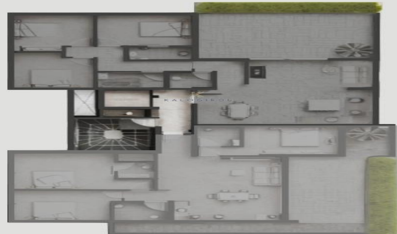
Roof Garden Floor