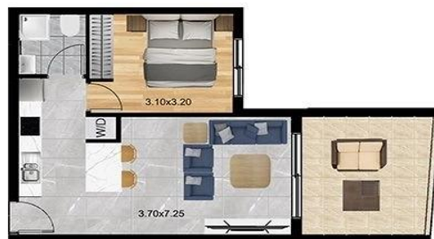
Internal Area # 50 SQM Covered Veranda # 14 SQM