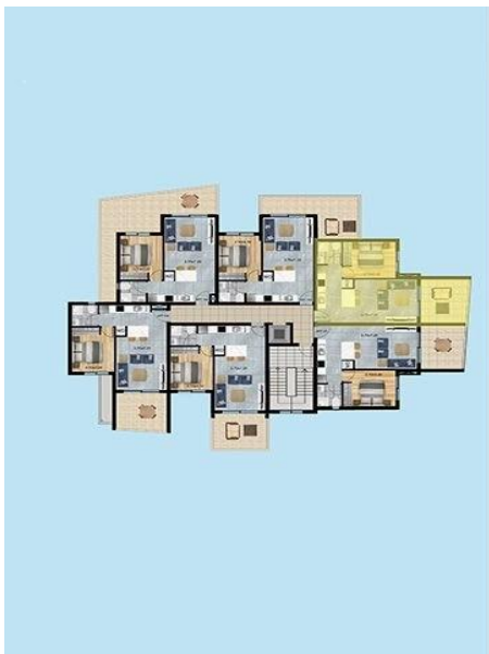
FIRST FLOOR PLAN FLAT 102