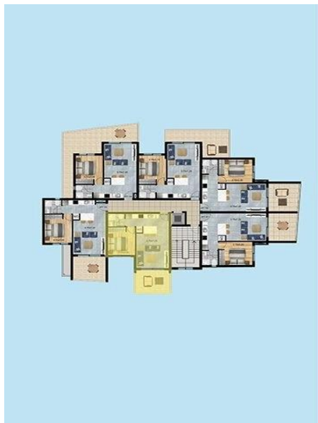
FIRST FLOOR PLAN FLAT 106