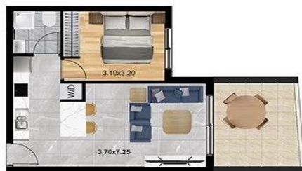
Internal Area # 50 SQM Covered Veranda # 13 SQM