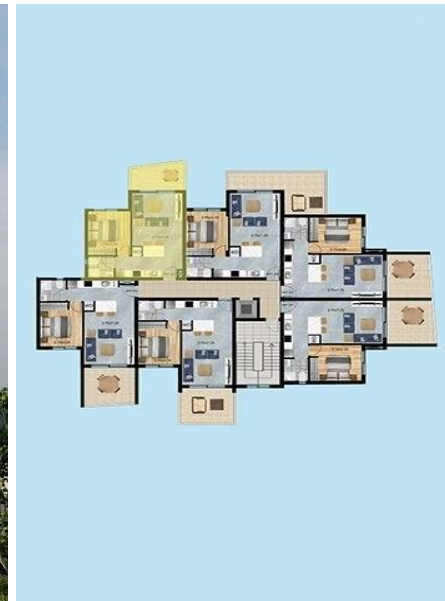
SECOND FLOOR PLAN FLAT 204