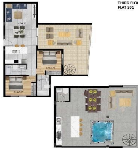
THIRD FLOOR PLAN FLAT 301

Internal Area # 83 SQM Covered Veranda # 40 SQM Roof Garden # 77 SQM