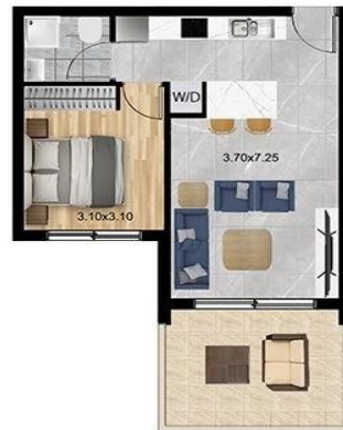
Internal Area # 50 SQM Covered Veranda # 13 SQM