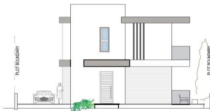
side elevation 1 (north-west)