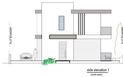
side elevation 1 (north-west)