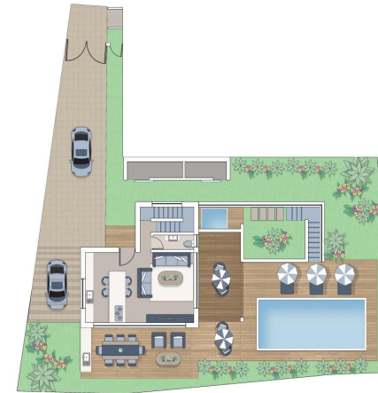
Firsst Floor Plan