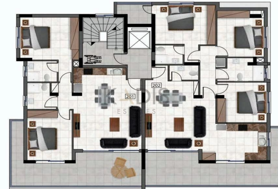
ΚΑΤΟΨΗ 2ου ΟΡΟΦΟΥ