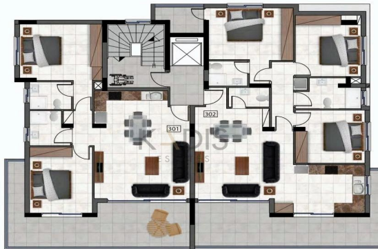
ΚΑΤΟΨΗ 3ου ΟΡΟΦΟΥ