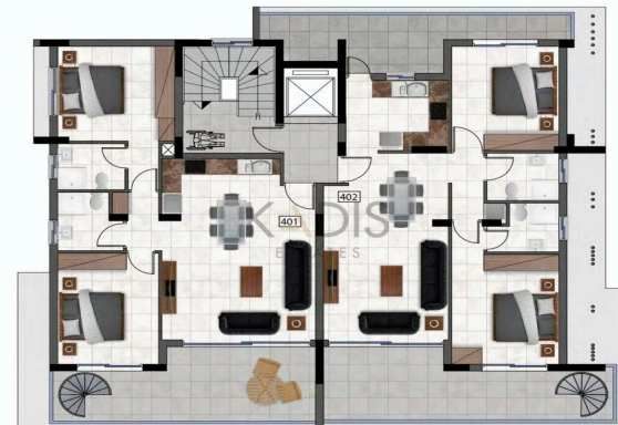
ΚΑΤΟΨΗ 4ου ΟΡΟΦΟΥ