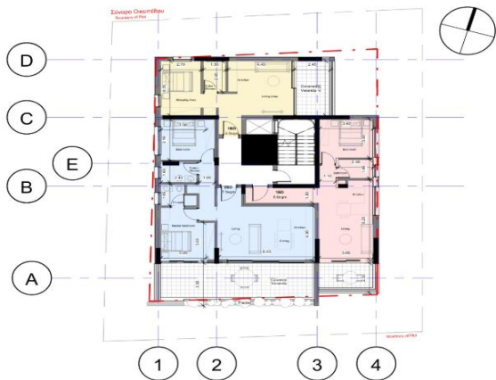
SIENA _Typical Floor