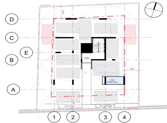
SIENA _Ground Floor