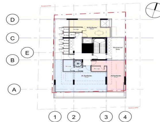
SIENA _Roof Garden