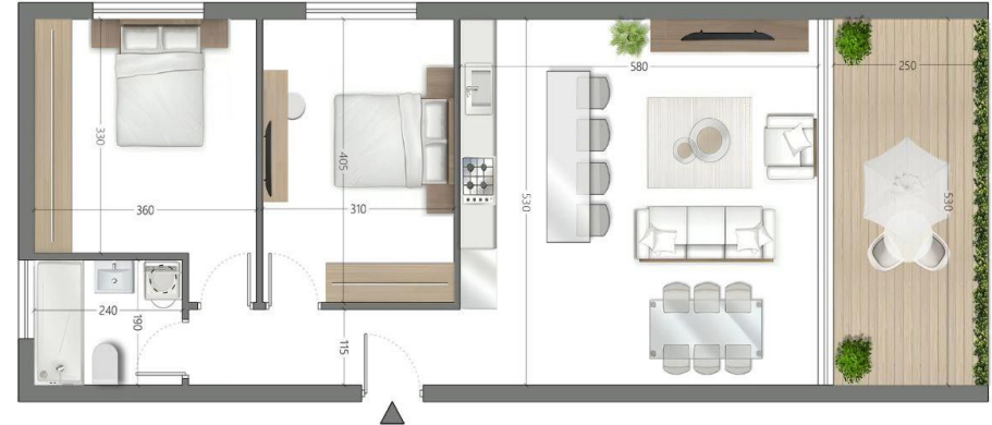
➤ N ONE BEDROOM 50 SQM + 10 SQM COVERED