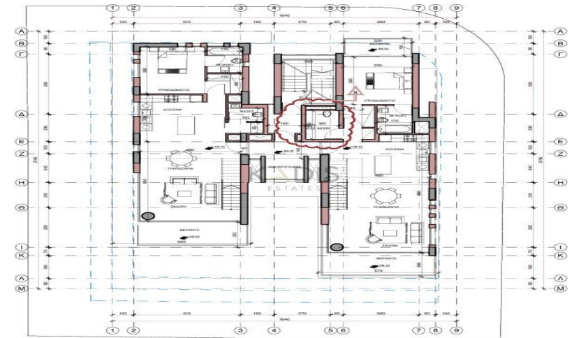
ΚΑΤΩΦΗ ΕΠΙΠΕΔΟ 0 (ΔΙΟΡΘΩΡ ΔΙΑΜΕΡΙΣΜΑ 3 ΥΠΝΟΔΟΜΑΤΙΩΝ ΚΑΤΩΤΕΡΟ ΕΠΙΠΕΔΟ)