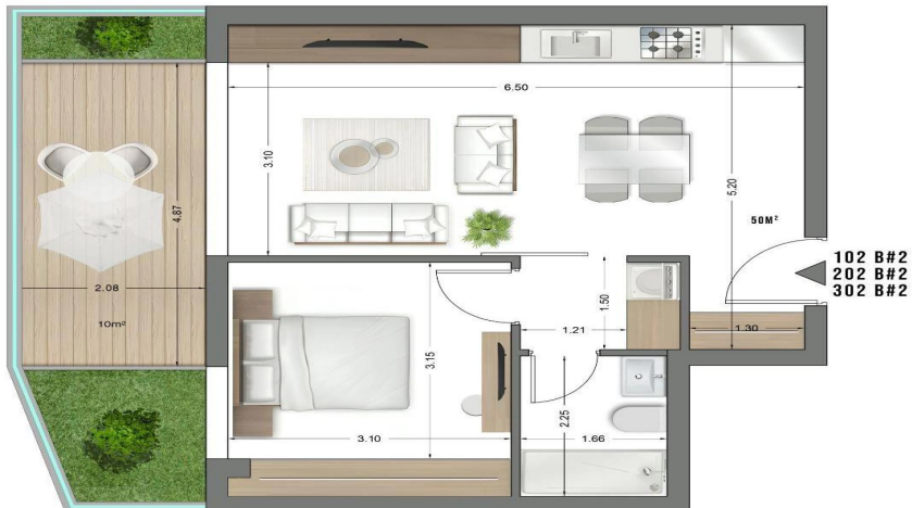
1 BEDROOM 50 SQM + 10 SQM COVERED