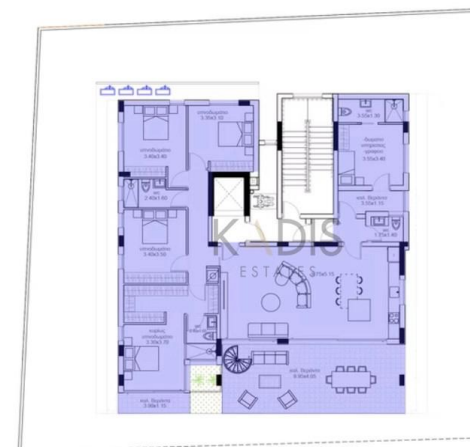
KATOYH 6ou OPOFOY