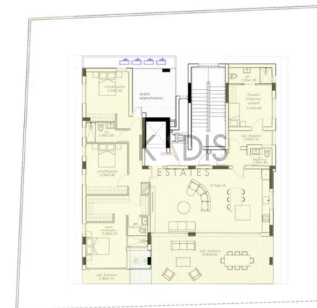
ΚΑΤΩΗ 1ου ΟΡΟΦΟΥ