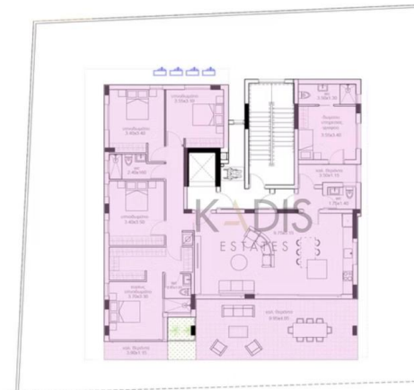
KATOYH 4ou OPOFOY