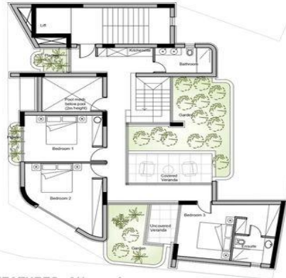
HOUSE 1_First Floor_1:100