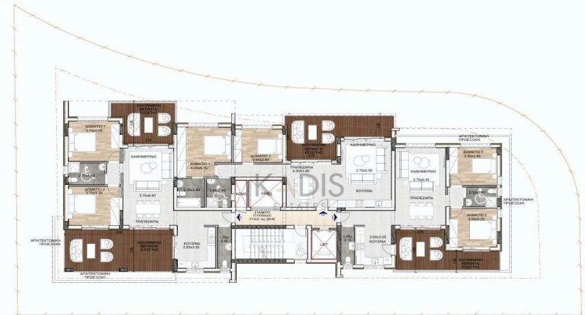
2. KATΩH 2ou OPOFOY 1:100