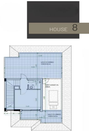
ROOF GARDEN FLOOR

LAND AREA: 300.1m 2 GROUND FLOOR AREA: 89.7m 2 FIRST FLOOR AREA: 95.5m 2 ROOF GARDEN ENCLOSED AREA: 29.6m 2 TOTAL HOUSE AREA: 215.2m 2