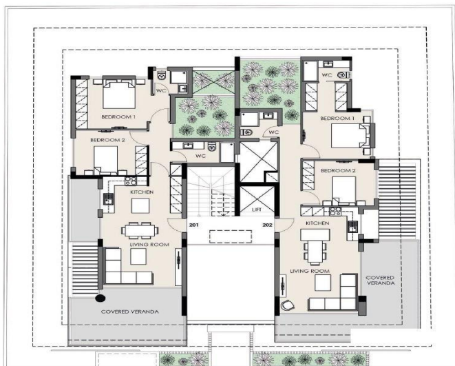
FLOOR PLANS SECOND FLOOR