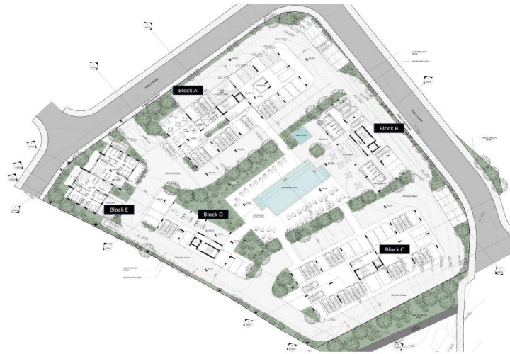
Block A&C Basement