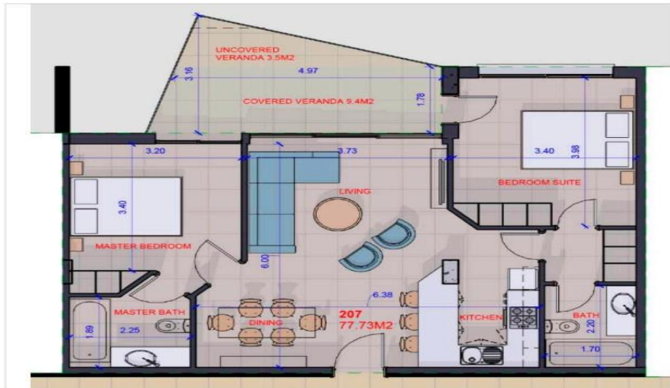
PRELIMINARY APARTMENT PLAN