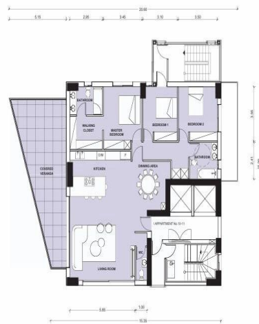
10th-11th FLOOR PLAN SCALE 1:100