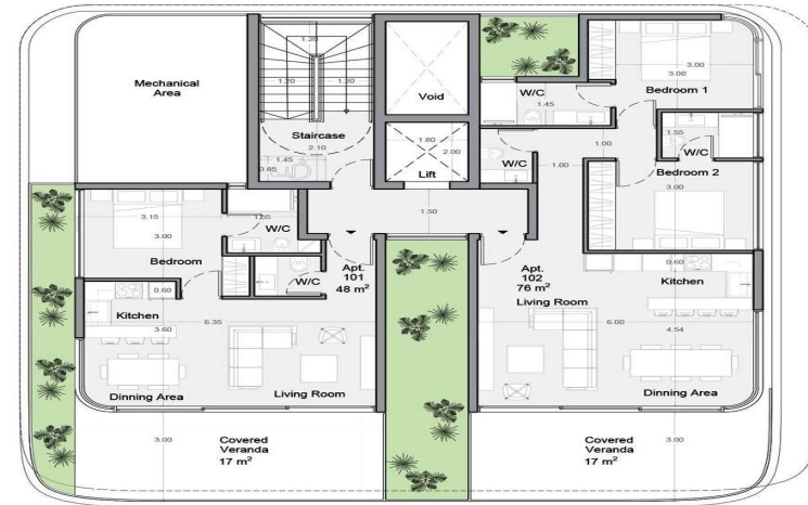
First FLOOR PLANS