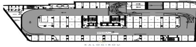
parking level -1