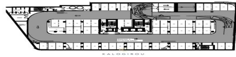
parking level -1