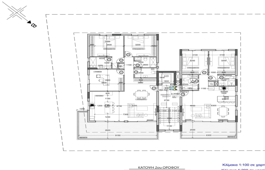
ΚΑΤΩΦΗ 2ου ΟΡΟΦΟΥ

Κλίμακα 1:100 σε χαρτί Α1 Κλίμακα 1:200 σε χαρτί Α3