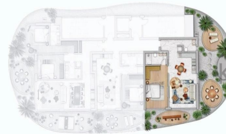
Seaview apartment with private garden