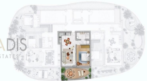
Seaview apartment with spacious veranda