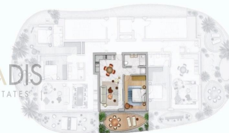
Seaview apartment with spacious veranda