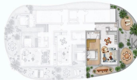
Seaview apartment with private garden