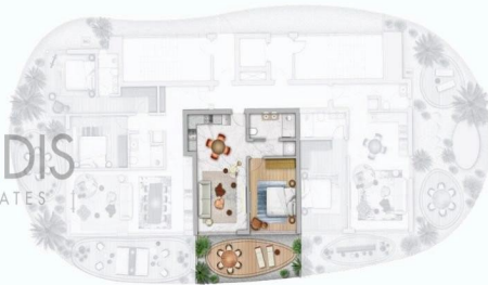
Seaview apartment with spacious veranda