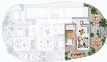
Seaview apartment with private garden