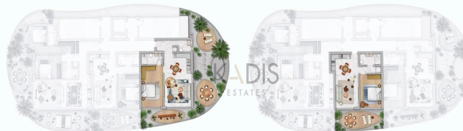
Seaview apartment with private garden