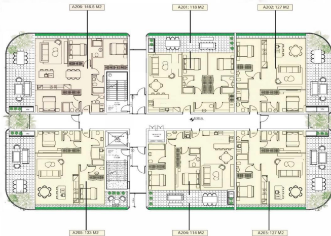
BLOCK A Levels 2 - 8