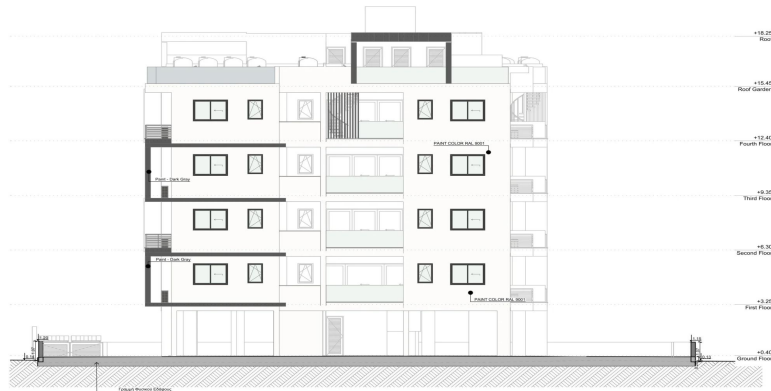
E-04 West Elevation 1:100