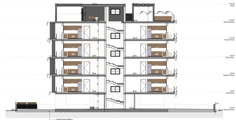
S-01 Section A-A